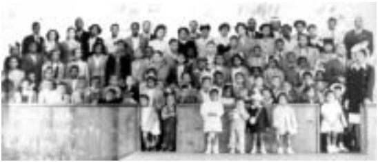
SINCLAIR PARK COMMUNITY CHURCH SUNDAY SCHOOL ON EASTER SUNDAY, 1944.